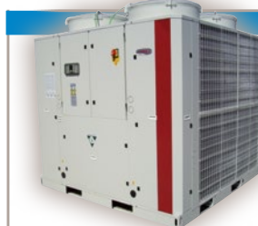
ECOLEAN 10 to 120 kW