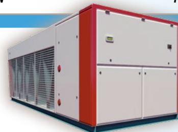
NEOSYS® 120 to 630 kW

Switching enclosure with Butterfly™ door. Protection of components and persons in case of adverse weather conditions.